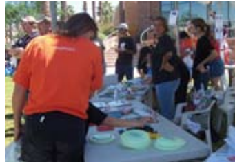
Estrella Mountain Ranch