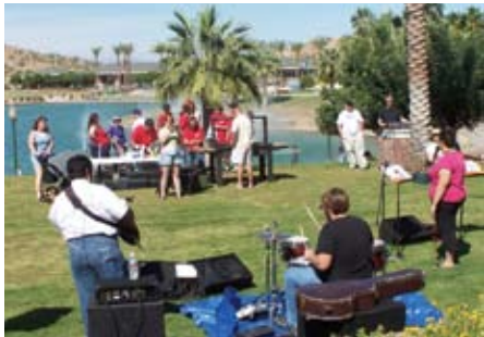
Estrella Mountain Ranch