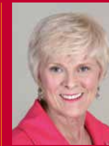
Mayor Georgia Lord