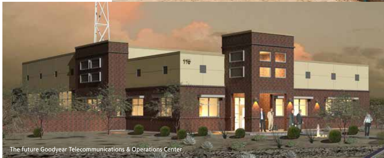
The future Goodyear Telecommunications & Operations Center