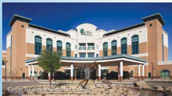
Cancer Treatment Centers of America