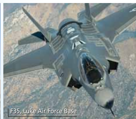
F35, Luke Air Force Base