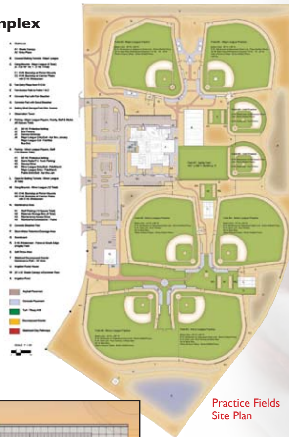
Practice Fields Site Plan