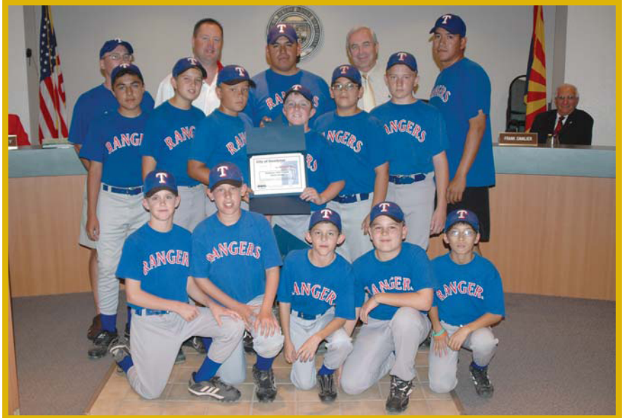
1st Winning Team - Rangers