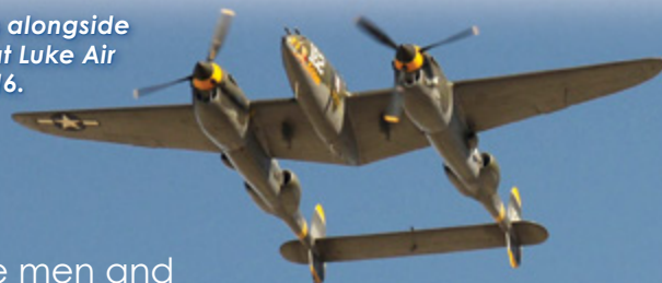
The P-38 Lightning flies alongside the F-35A Lightning II at Luke Air Force Base, April 1, 2016.